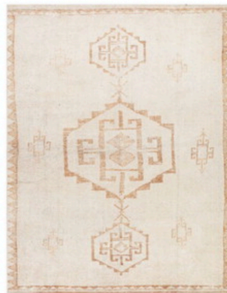
Designed by Becki Owens for Surya, this rug includes the shades of sand colors that are popular right now.