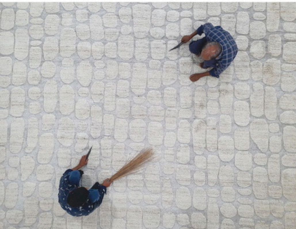
Fayette Studio is now producing rugs like this one in sizes such as 12 x 18 and 14 x 20.

"Green is hottest color right now," Tiwari said. "We are also seeing different shades of beige. If you look at the past three to four years, you'll see that the grays and blues are largely gone and have been replaced by taupe, beige and shades of sand. That's currently a hot color in industry. We are also seeing yellow that looks like sand along with shades of green such as sage." ■