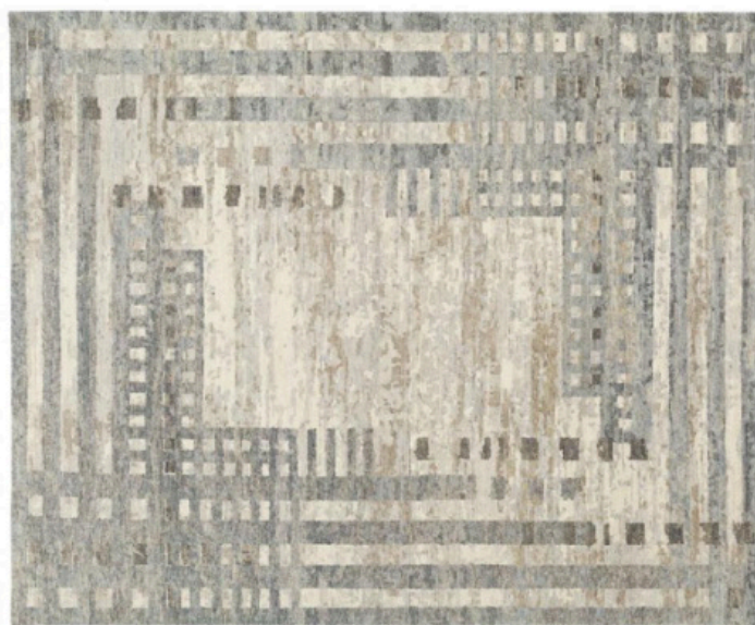
Tamarian's Moderna Blue Dusk is made of 100% wool and is hand-knotted in Nepal.