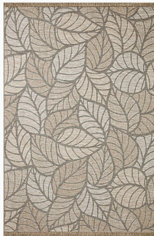
Loloi's Dawn Collection of indoor/outdoor rugs look like woven sisal rugs but are power-loomed of 100% polypropylene, which makes them water- and mildew-resistant.