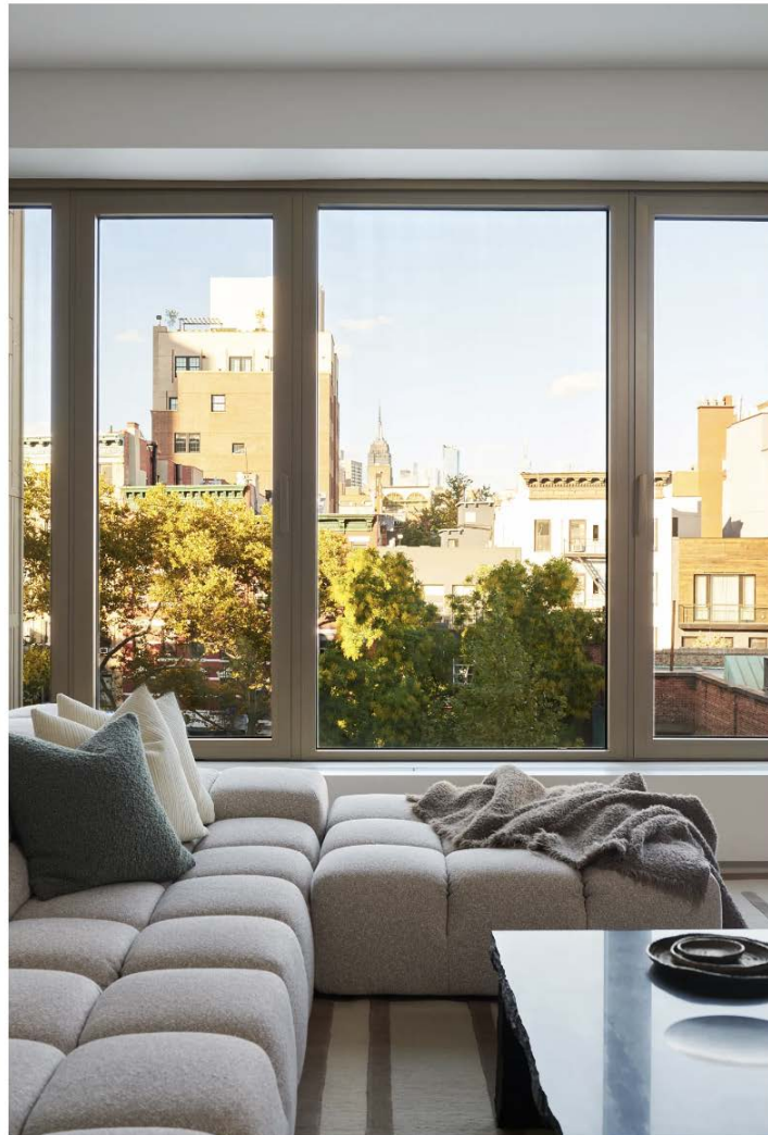
From the living room window you can admire the Empire State Building.