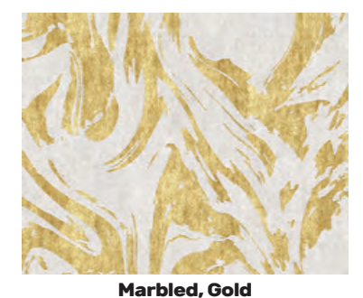
(Starting at $80 per square foot, Fayette Studio)