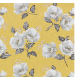
($85 per yard, Cath Kidston for Stout)