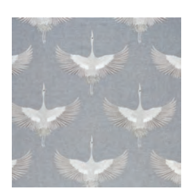
Aldrin 8 ($209 per yard, Marcus William)