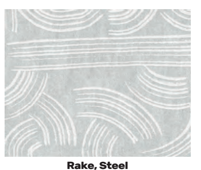
(Starting at $80 per square foot, Fayette Studio)